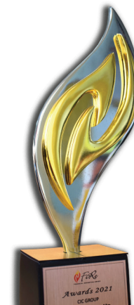
2nd Runners Up Financial Reporting Award Insurance Category