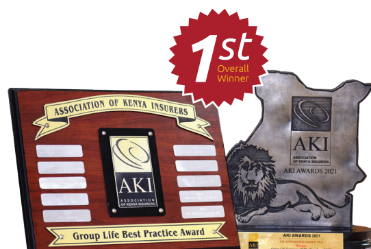
Overall Winner AKI Awards 2021 Group Life Company of the Year Award